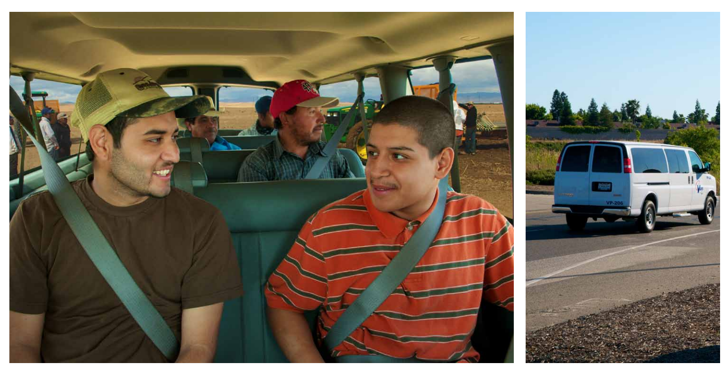
From left: Hired agricultural workers in a vanpool; CalVans vanpool.

California's specialty crop producers rely heavily on the availability of farm labor in their operations. Over the past several years, these producers have reported a decreasing supply of available labor. In response to these reports, the California State Board of Food and Agriculture (State Board) convened a panel of agricultural producers and employers, and affordable housing experts in August 2012 to investigate the housing and transportation issues faced by the state's agricultural producers and workforce, with the assumption that these issues present access barriers to workers and contribute to labor shortages. This was followed in early 2013 by the California Department of Food and Agriculture (CDFA) engaging Ag Innovations Network (AIN) in organizing a longer-term initiative to bring together the state's agricultural, labor, housing, and transportation leaders to develop a set of recommendations for addressing these issues. AIN is a California nonprofit organization that specializes in helping stakeholders solve problems in the food system through effective collaboration.