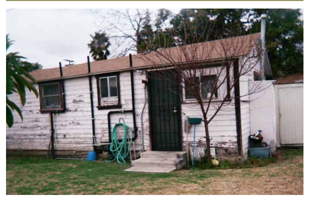
Existing farmworker housing in need of repair.

In addition to improving existing stock, new affordable housing is needed both in traditional rural and agricultural regions, and also in California's cities, towns, and municipal jobs at nearby farms and processing sites.