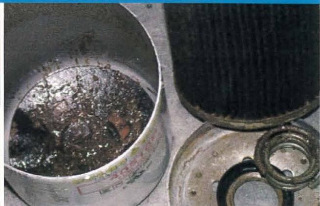
F3. - Corroded Dispenser Filter