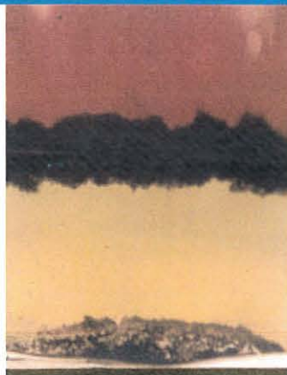
F2. - Diesel Tank Bottom Sample w Microbes