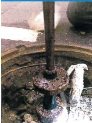
F1. - ATG Floats w Corrosion Products