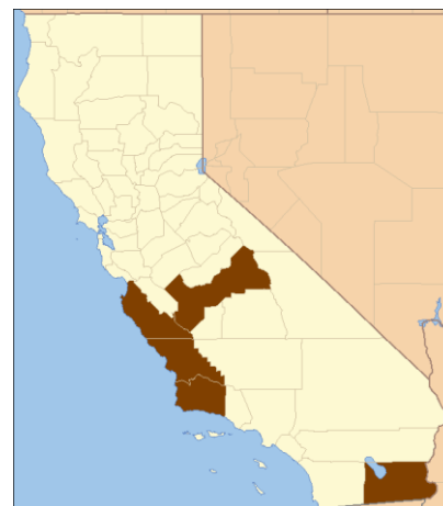
Figure 2: Location of the five leading broccoli producing counties in California [4] .